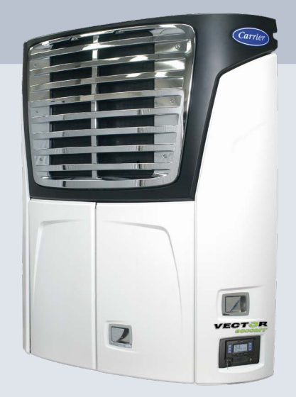
Model 8600MT shown with chrome grille/stainless latch option.